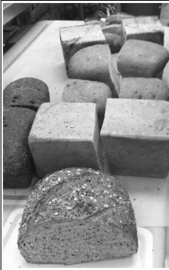
Bread being prepared for distribution.

containers to the smaller 1/2 dozen sized containers. We washed our hands, put on