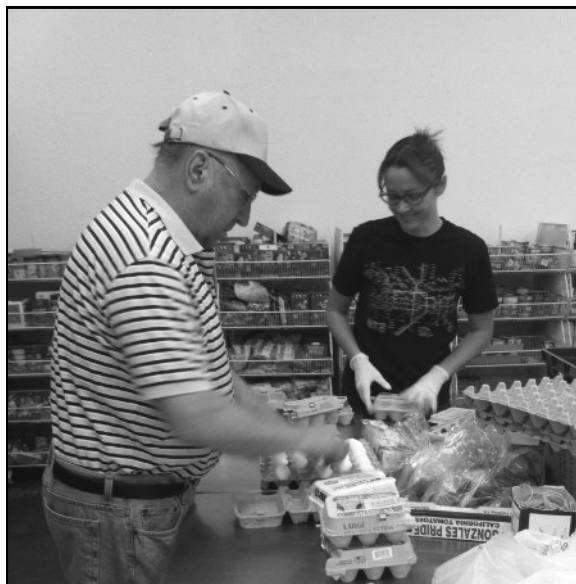
Volunteers package eggs for distribution.

livered to Holy Nativity Church. They add to it