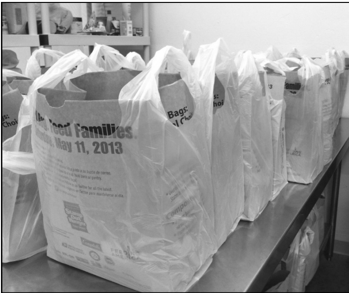
Bags of food awaiting distribution at the Food Pantry-LAX.

Bank has seen the need for food assistance programs increase by 73%. The Westside Food Bank distributes annually, 4.7 million pounds of food to over 70 social service agencies. Food Bank distribution is done