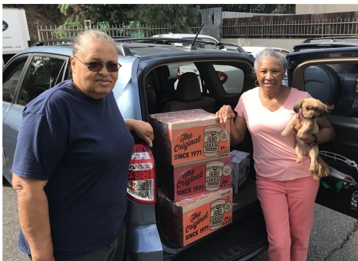
Above: Members of the Road 2 Damascus Church in Carson CA with their monthly donation.

We are very grateful to all who so generously donate to Food Pantry, LAX. Here are just a few of the donations we have received in the past few months.