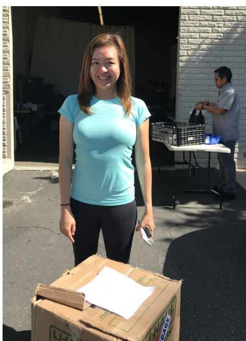
Right: A grateful former client with a pallet of toys she donated for the children whose families come to Food Pantry, LAX each week.