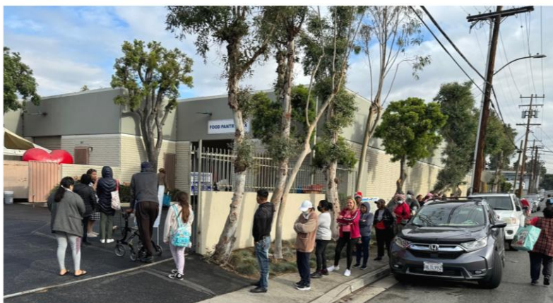
Customers wait in line for food Tuesday and Friday mornings.

Still, challenges loom. Last year the pantry ran a huge deficit as it gave out a record amount of food. Cutbacks in federal programs under the new administration in Washington threaten to decrease the pantry's supply of food while also